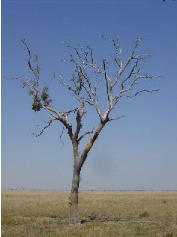
Plate 5: DSC02753