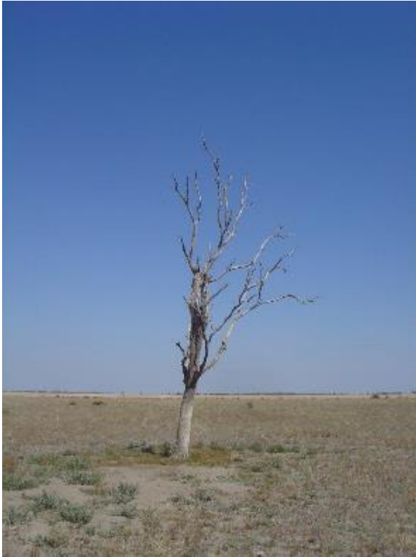
Plate 9: DSC02748