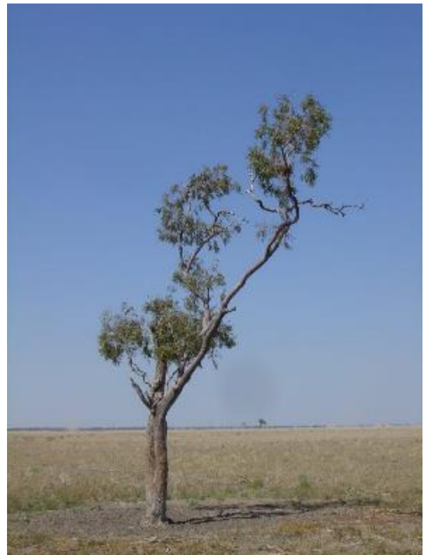
Plate 4: DSC02752