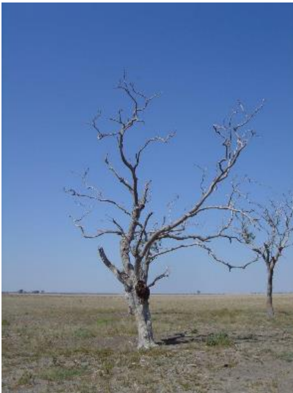
Plate 3: DSC02751