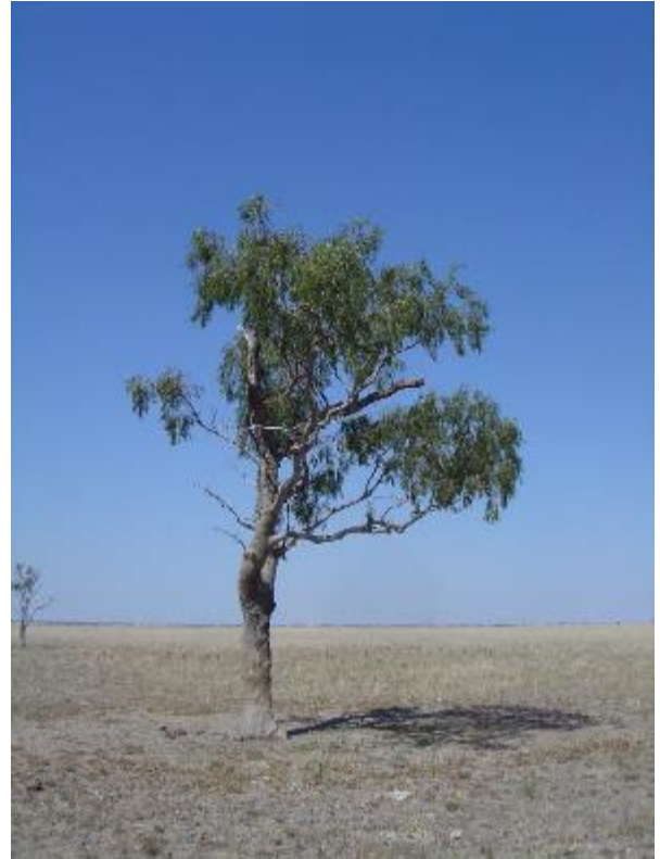
Plate 6: DSC02754