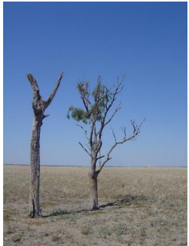
Plate 8: DSC02756