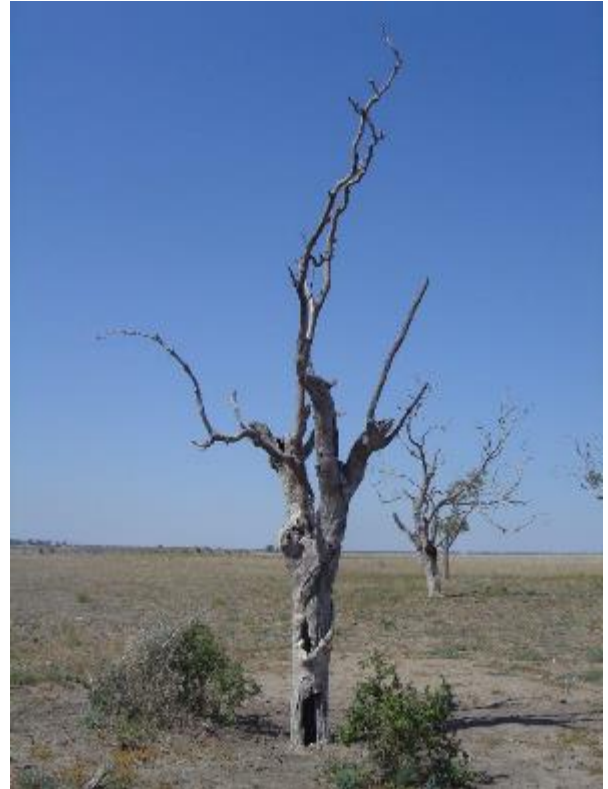
Plate 2: DSC02750