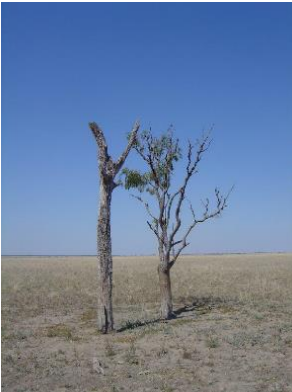
Plate 7: DSC02755