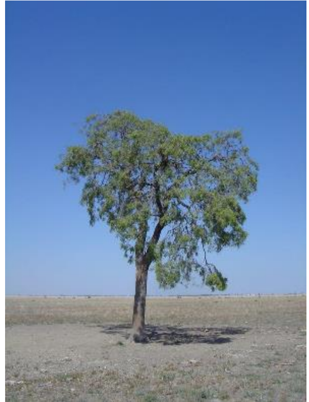
Plate 10: DSC02747 (Whitewood)