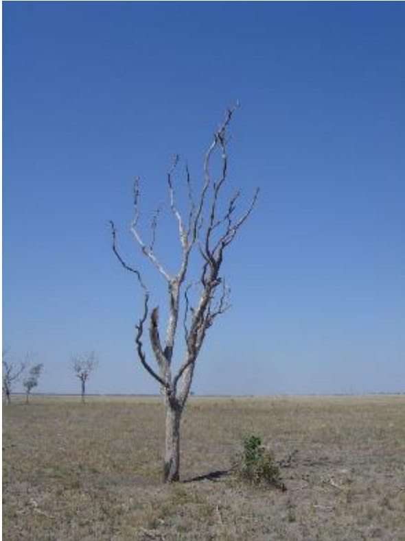
Plate 1: DSC02749